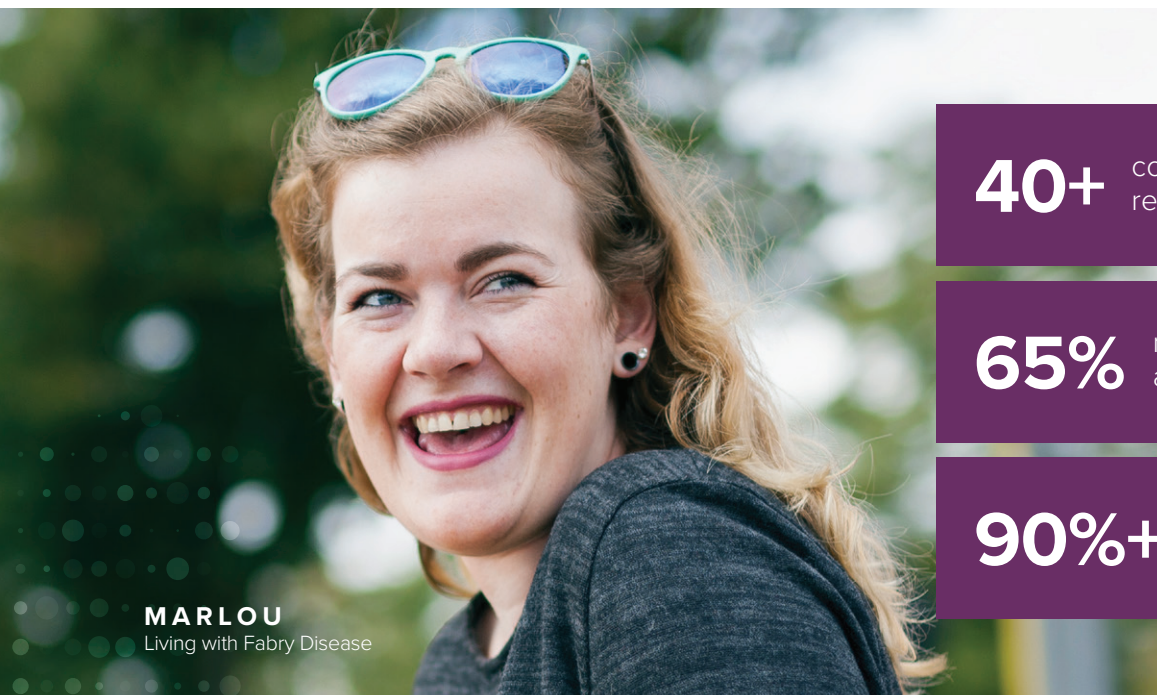
MARLOU Living with Fabry Disease

Galafold (migalastat) is an oral pharmacological chaperone of alpha-Galactosidase A (alpha-Gal A) for the treatment of Fabry disease in adults who have amenable galactosidase alpha gene (GLA) variants.